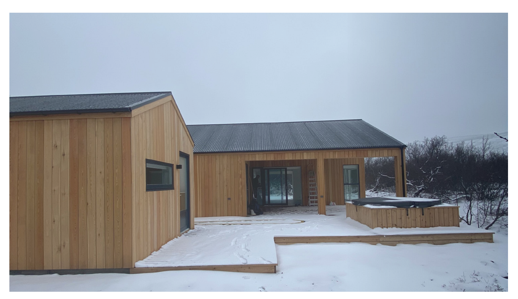
Vinnu við nýja húsið í Húsafelli miðar vel áfram